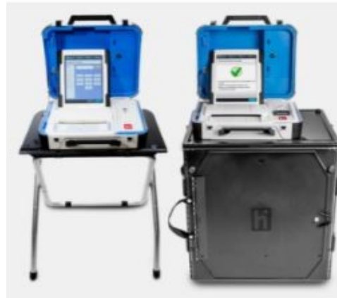
Verity Duo Voting Booth & Verity Scan Station

3. Follow the Prompts on the screen using the TOUCH SCREEN to make selections USING the REVIEW & NEXT buttons to move back & forth between ballot pages.